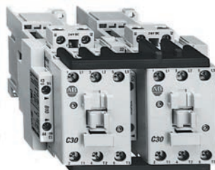
Cat. No. 104-C30ZJ22