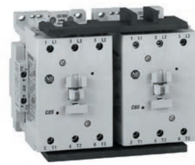
Cat. No. 104-C85D22