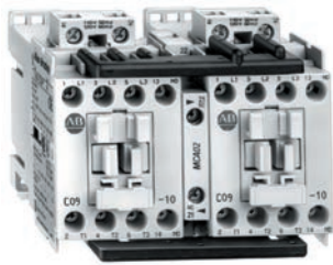
Cat. No. 104-C09D22